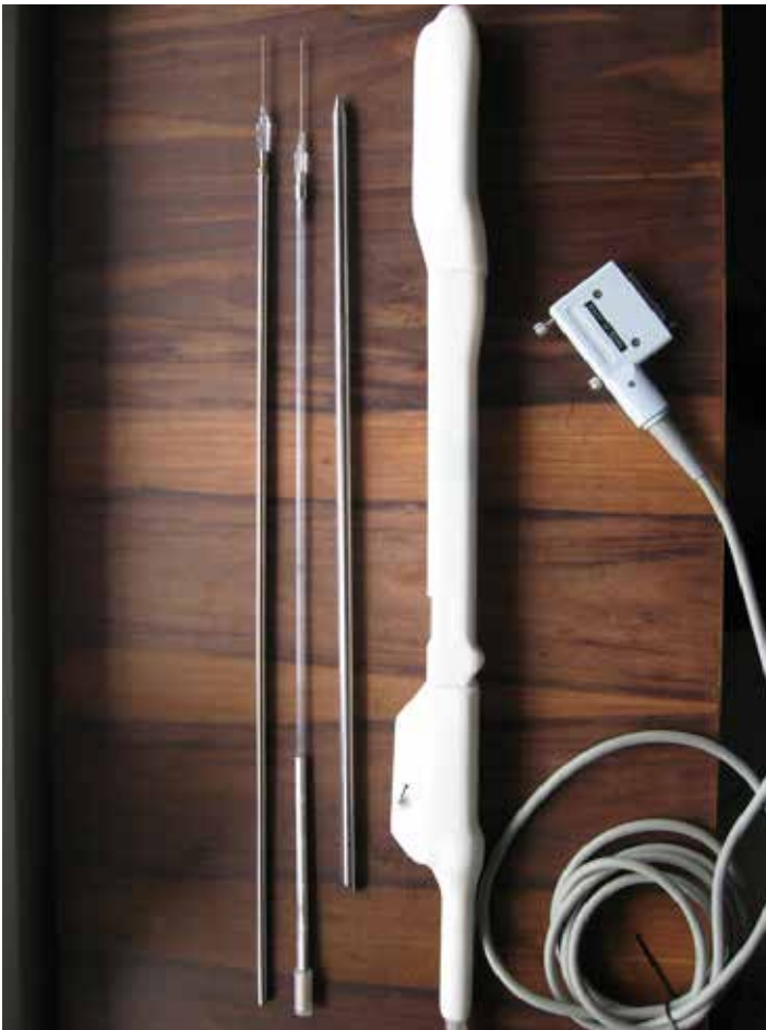
Transvaginal ultrasound wand