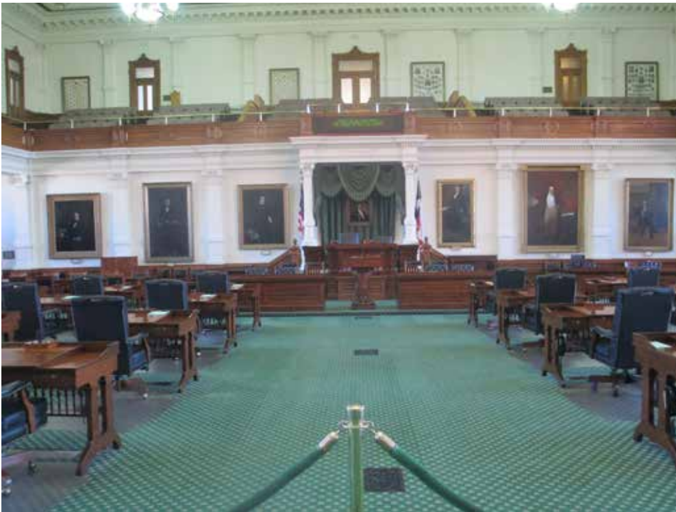
Senate chambers in Austin, Texas

In Texas, a TRAP law passed by the state House in 2013 would require abortion clinics to adhere to the same standards as surgical clinics, even though many of the clinics only administer non-surgical abortions. 3 After State Senator Wendy Davis staged an 11-hour filibuster of the bill, Gov. Rick Perry called a special session to pass it. 4 The bill threatens to shutter most of the state's abortion clinics. 5