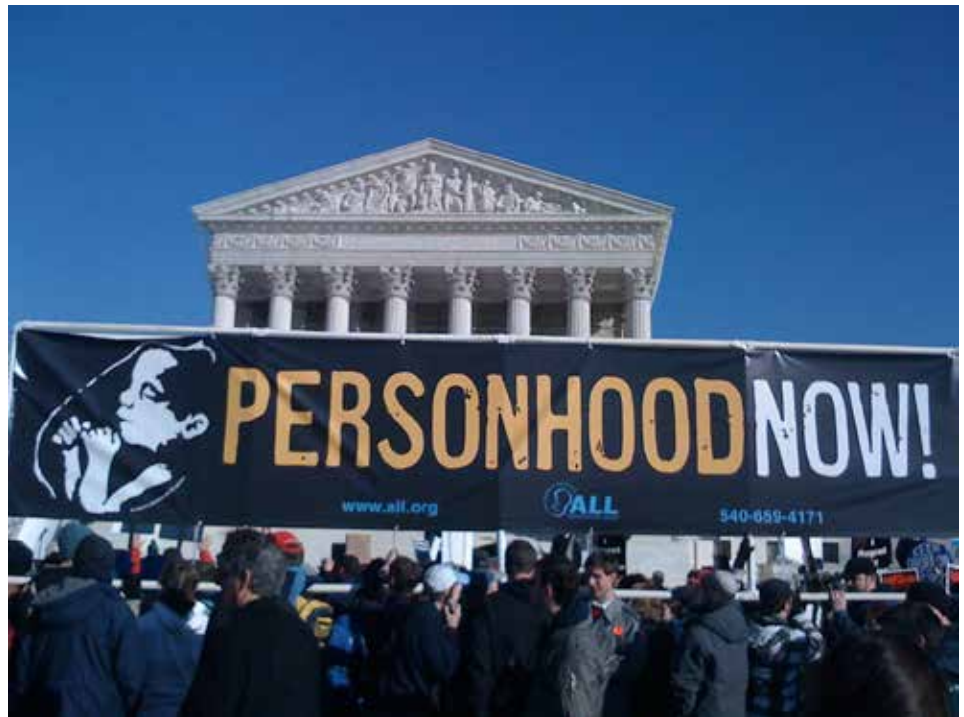
Personhood laws present an extreme threat to women’s rights and health, preventing doctors from providing appropriate care to women, even when their lives are in danger.

ban all abortions in the United States. 104